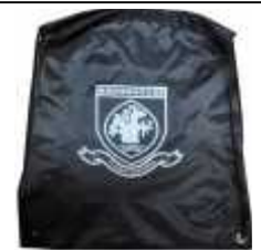
Brookhouse Swimming Bag at Ksh 450/=