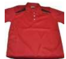
Brookhouse Polo T-shirt at Ksh 1,200/=