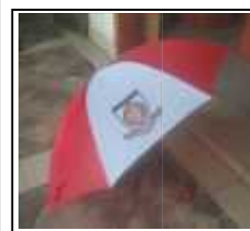
Brookhouse Umbrella at Ksh 550/=