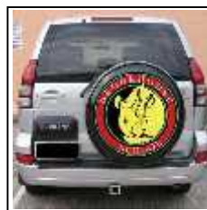
Brookhouse wheel covers available at Ksh 2,500/=

Medium size Large size Extra Large size Ksh 4,000/=