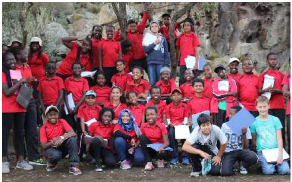
Year 7 field survey trip to Naivasha